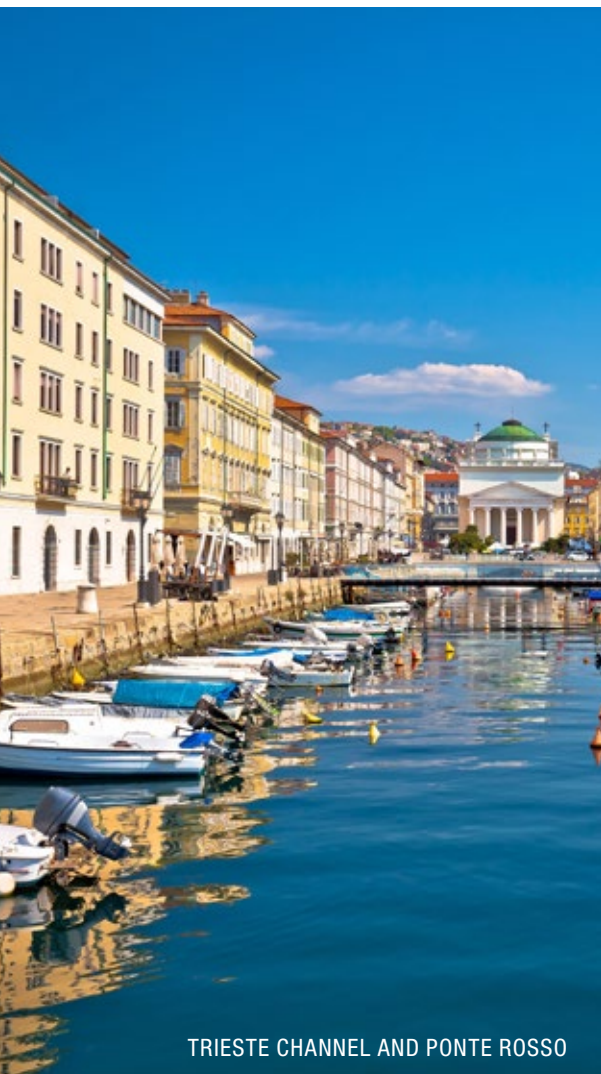
TRIESTE CHANNEL AND PONTE ROSSO